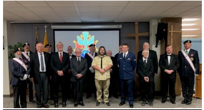
Fourth Degree Exemplification in Helena October 10th

“Where there’s a need, there’s a Knight”