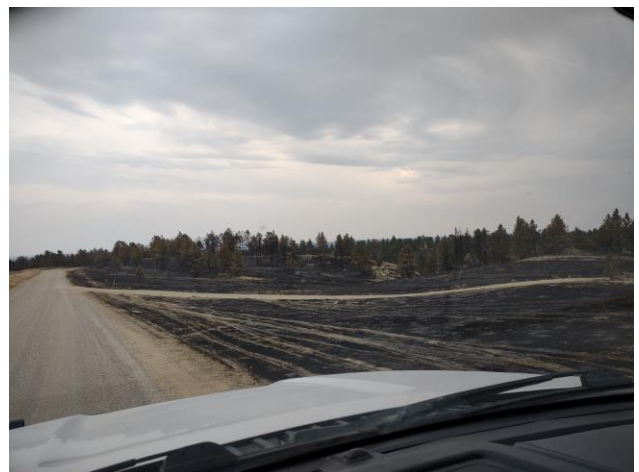
Wildlands fire West of Roundup

Council 1259 feeding the homeless in Billings