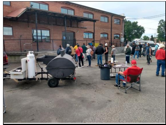
Feeding the homeless in Billings