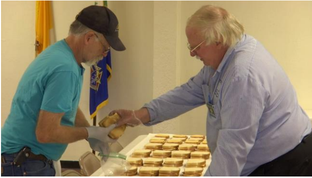
Council members make sandwiches for firefighters