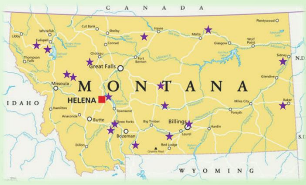
Purple stars denote lakes included in this tournament!

Scan this QR code to be taken to the tournament website!